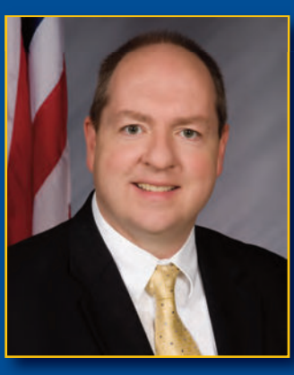
DISTRIBUTED BY: SEN. GREG WALKER SERVING SENATE DISTRICT 41